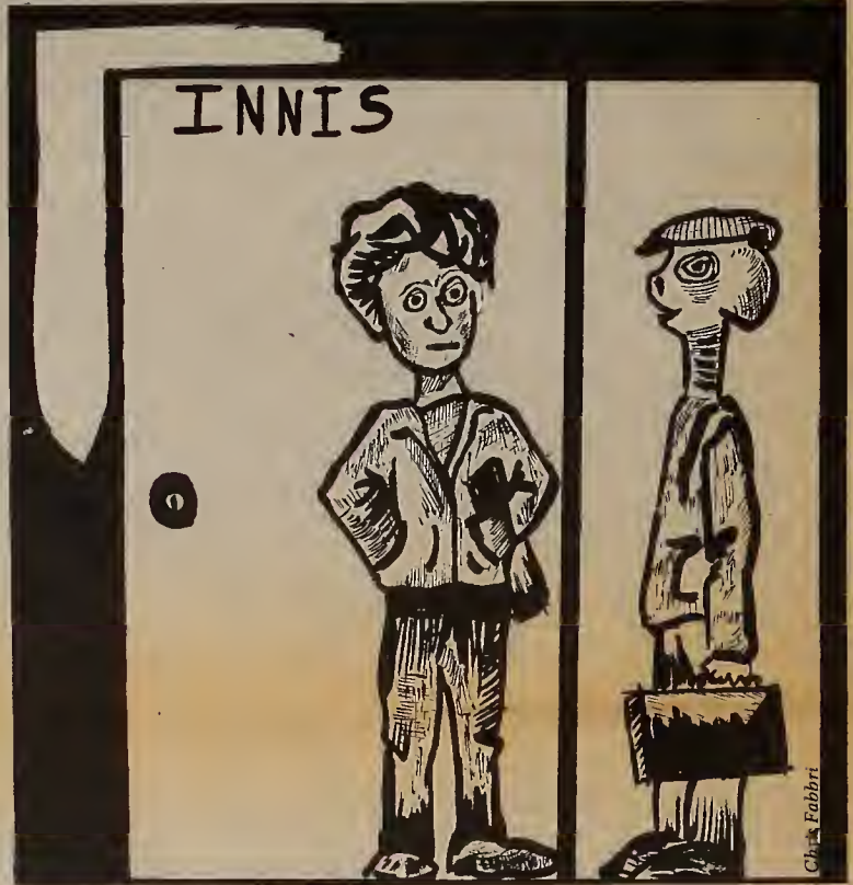
When do I register if my name is --*4 = 1$ ÷ rd$?

Government best serves the community by encouraging us to partake of what it offers. Student government, Clubs, Sports and, yes, newspapers will only be as strong as the community that feeds them. Innis awaits.